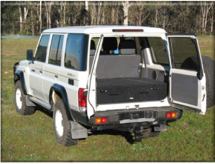
“Aluminium std 2 drawer” Super light and Super practical.