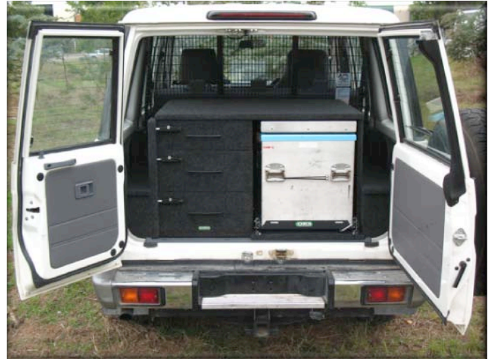
“Reverse Fridgepack 3” to suit an Explorer Fridge, optional “Ausguard cargo barrier.