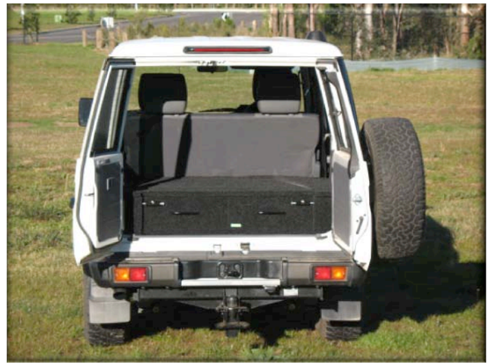
We use high quality ball bearing runners on all of our drawers and fridge slides. It makes for an effortless and rattle free operation.