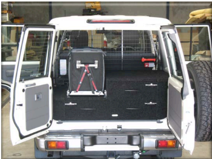
“Custom 3 Drawer System”. This particular system is all fixed together as one unit, but the top drawer can be made as a removable item if required.