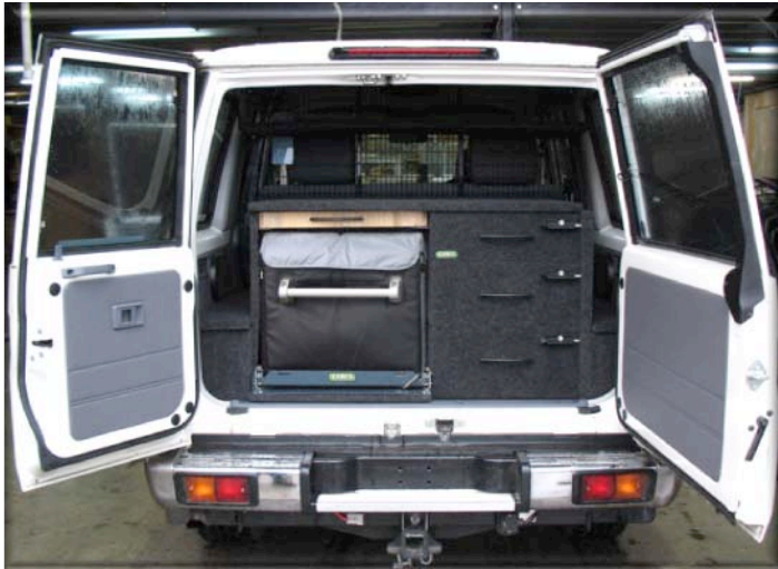
“Fridgepack 3” to suit a Waeco CF-80, optional pullout freestanding traveler table and “Ausguard cargo barrier.