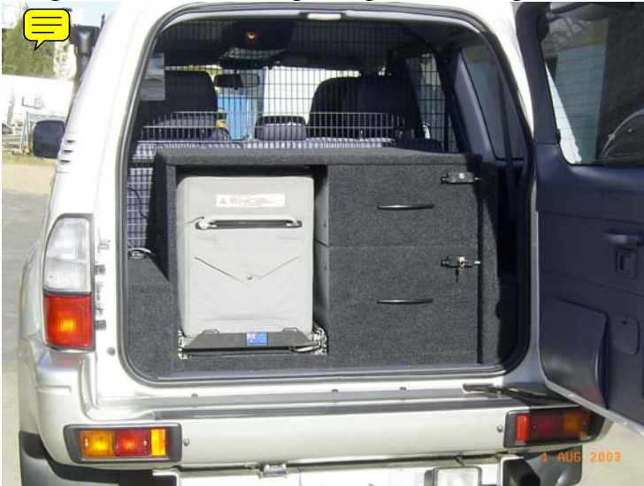
FridgePack 2 Drawer Large, Engel 40 lt, Cargo Barrier