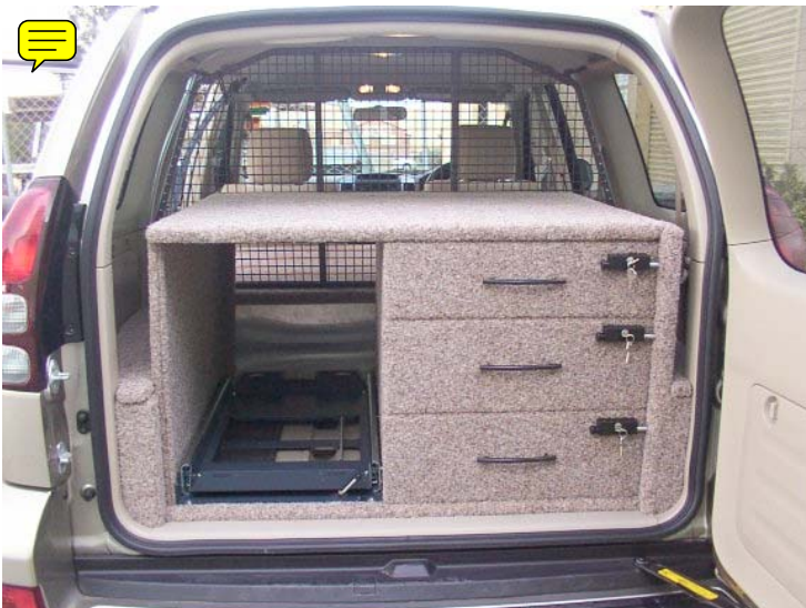
FridgePack 3 Drawer, Camel Carpet, Cargo Barrier 40 Lt Stainless Steel water tank