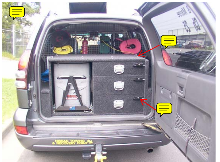
FridgePack 3 Drawer, Engel 40lt Fridge, Std Layout