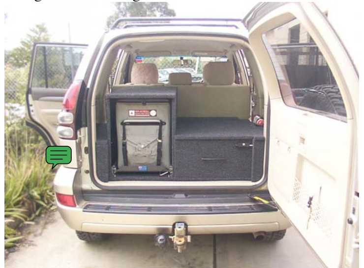
FridgePack 1 Drawer Large Engel 40 litre Fridge