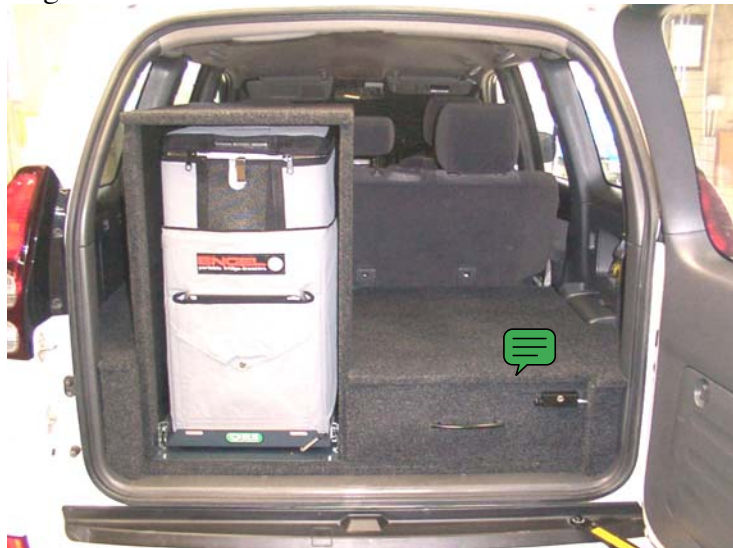
FridgePack 1 Drawer Medium Engel 40 litre with 2 Zone