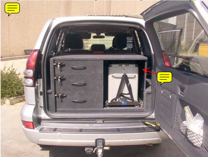
FridgePack 3 Drawer, Engel 40lt Fridge, Reverse Layout