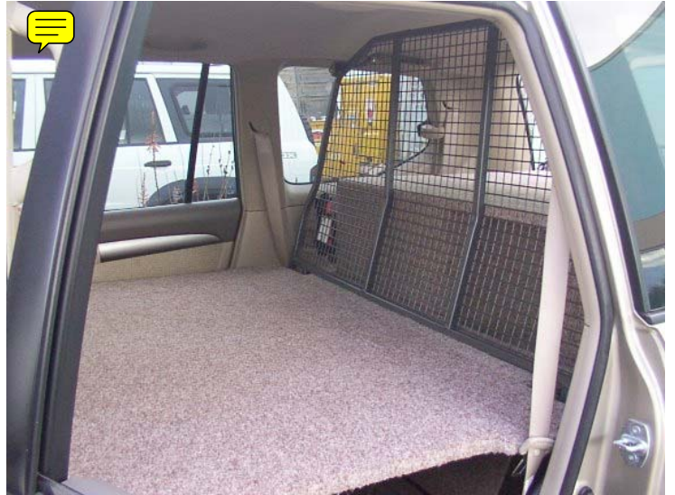
Bed Extension / Cargo Shelf- Half Cargo Barrier