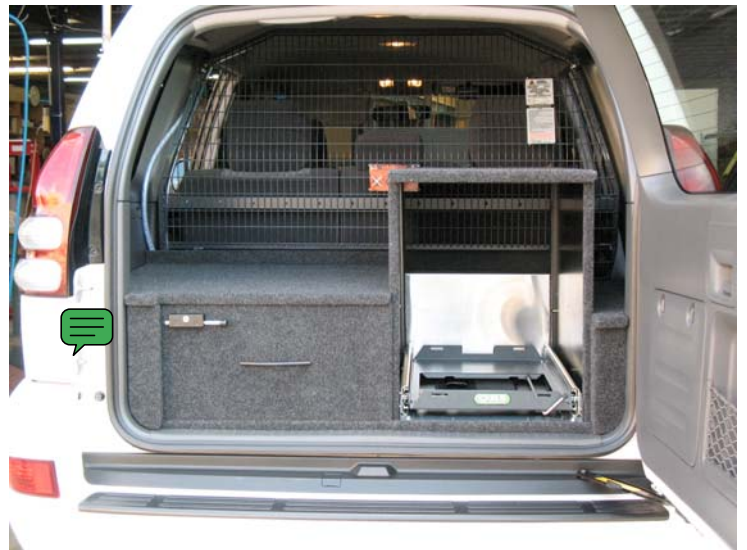
FridgePack 1 Drawer Large, Mirror Reverse 40 Lt Stainless steel Water Tank