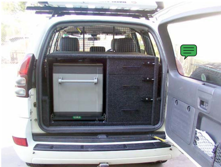
FridgePack 3 Drawer Special Waeco 110 litre Fridge Freezer fitted