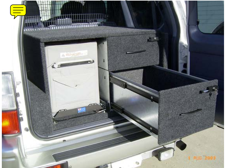
FridgePack 2 Drawer Lge, Engel 40 lt, Double Runners