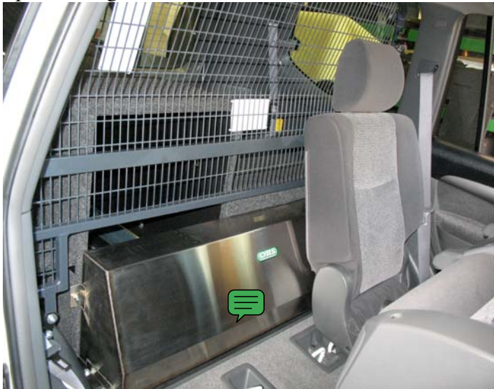
40 Lt stainless Steel Water Tank Special Cargo Barrier