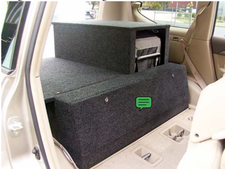
Security Storage Box shown mounted behind FridgePack 1 Drawer Large