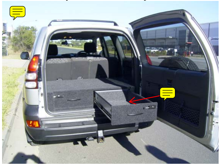
Std 2 Drawer System Charcoal Carpet