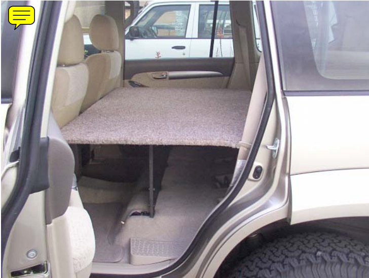
Bed Extension / Cargo Shelf- rear Seats Out