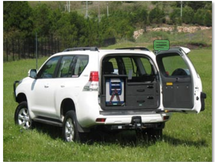
“Aluminium Fridgepack 2 Medium” with an ORS Fridge Slide and ARB 47ltr fridge. Basically, the same as a FP3 but without the top drawer.