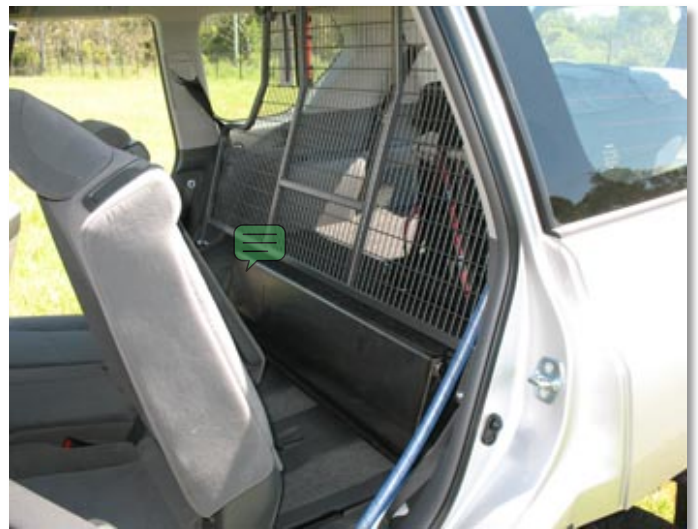
Optional 35ltr Stainless Steel Water tank fit’s neatly behind the back seat. Fresh water is always on hand and simple to access. 40ltr also available, to suit Fridgepack systems.