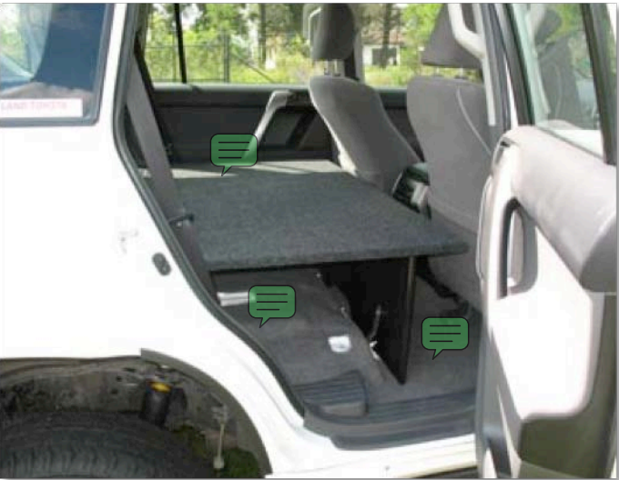
“Bed Extension / Storage Platform” replaces 2 nd row seats & is anchored to existing seat bolts. Great use of space & much lighter