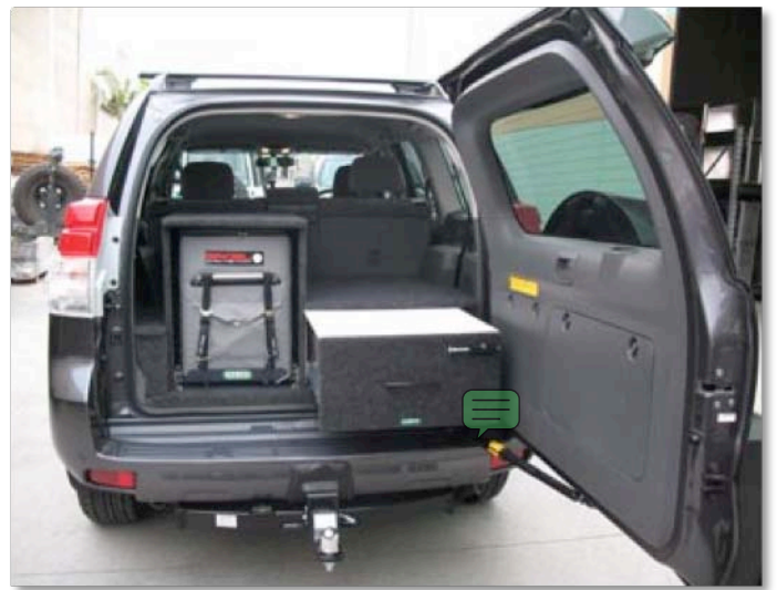
“FridgePack 1 Drawer Deep” with an optional “Drawer Top Table” A very practical setup for those towing a camper or caravan