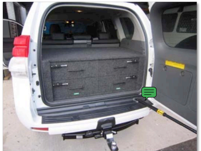
I threw this photo in to highlight some of the custom options we are capable of achieving. A 4 drawer unit in a GX Prado 150