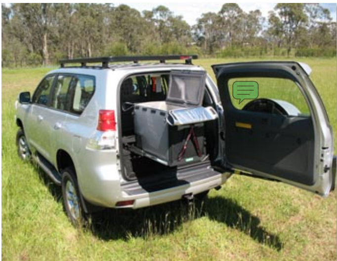
Note how easy it is to access a fridge once it is fitted to a fridge slide. A STD 2 drawer + a fridge slide is a very practical setup in a 150 Prado.