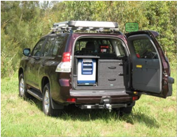
“Aluminium Fridgepack 2 Special” with an ORS Fridge Slide and ARB 47ltr fridge. Deep bottom drawer is fitted with the double runner option.