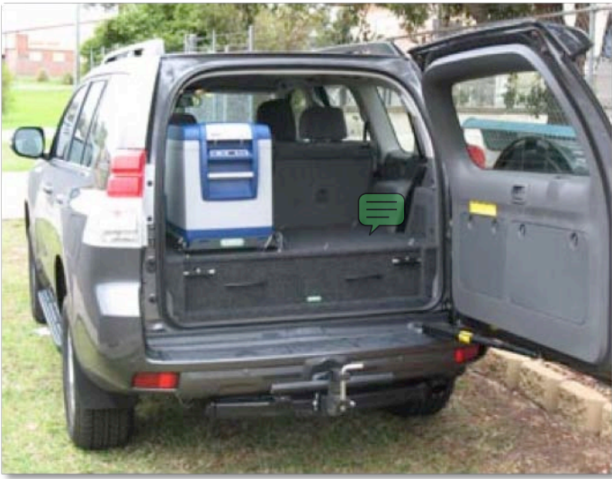
“Aluminium Standard 2 Drawer” with an ORS Fridge Slide a ARB 47lt fridge. This vehicle is a GXL model with the 3 rd row seat’s removed