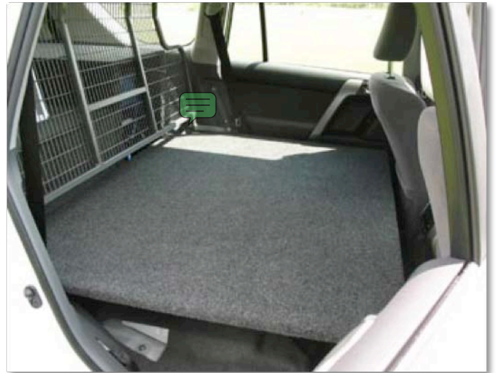
“Storage Platform shown with ½ cargo barrier” . The platform can be removed & the seats re-fitted easily