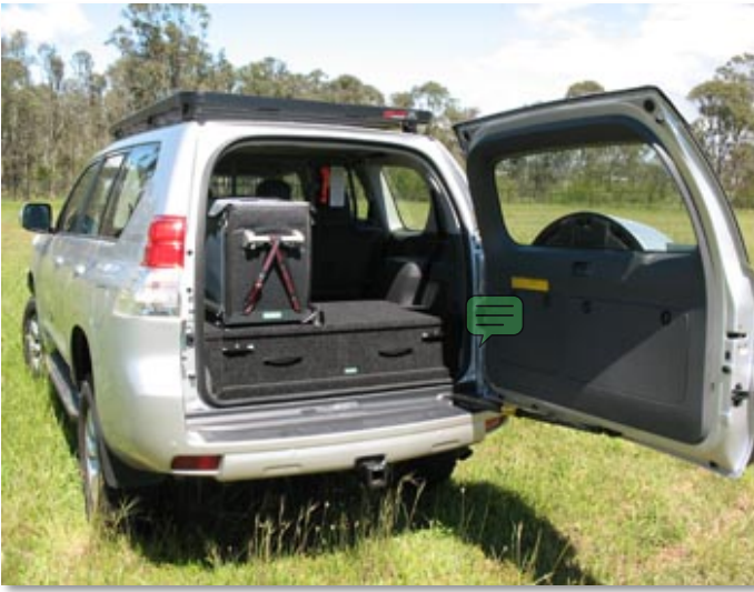
“Aluminium Standard 2 Drawer” with an ORS Fridge Slide a Weaco CF-50 fridge. This vehicle is a GXL model with the 3 rd row seat’s removed