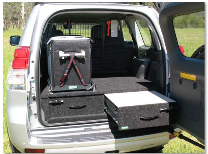
“Standard 2 drawer” with an optional “Drawer Top Table” Makes those quick cuppa breaks nice and simple.